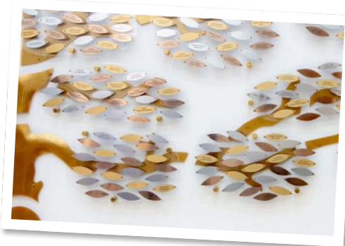
Memory Tree at the hospice

If you don't have a plan yet we've got some ideas to inspire you. You'll find our favourites on our website stwhospice.org/get-involved with details of our Challenge, Fundraising and Community events.