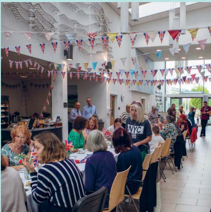
A celebration of the Platinum Jubilee at the hospice

However you choose to support St Wilfrid's, please ensure that any instruction clearly includes our unique Registered Charity Number 283686 . This will ensure your gift arrives safely and promptly.