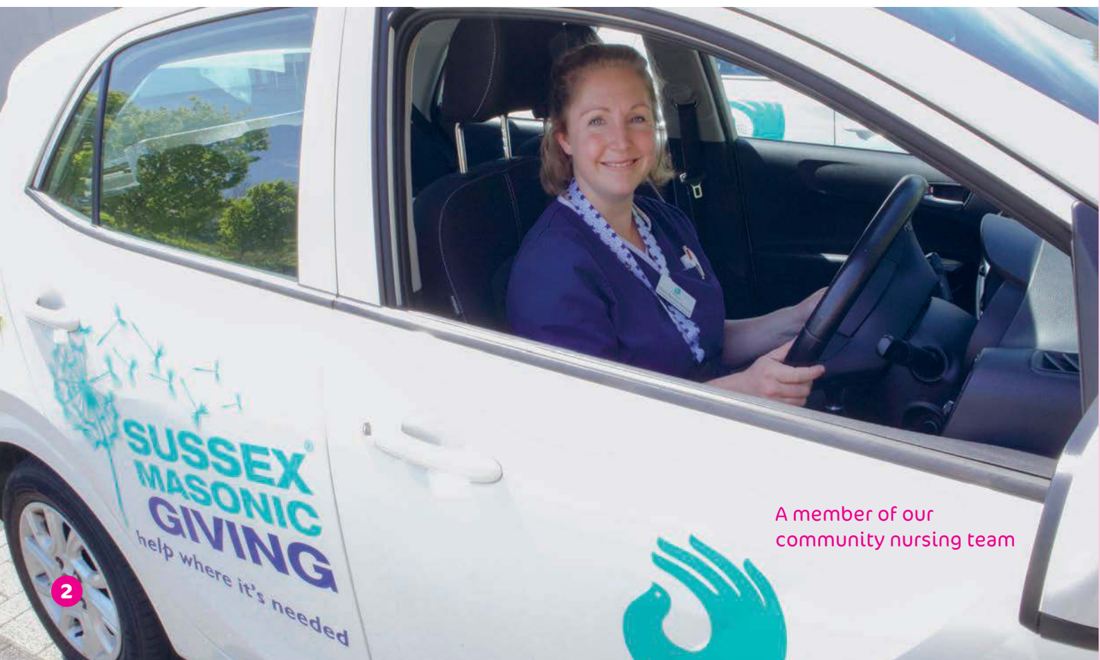
A member of our community nursing team

Now, we ask all in our community to consider leaving a gift in their will to St Wilfrid's – to 'Give Back to the Future' – and create the foundation of hospice care for all local people, for years to come.