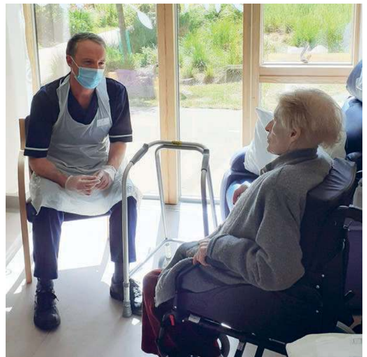
One of our Nurses with a patient in the hospice