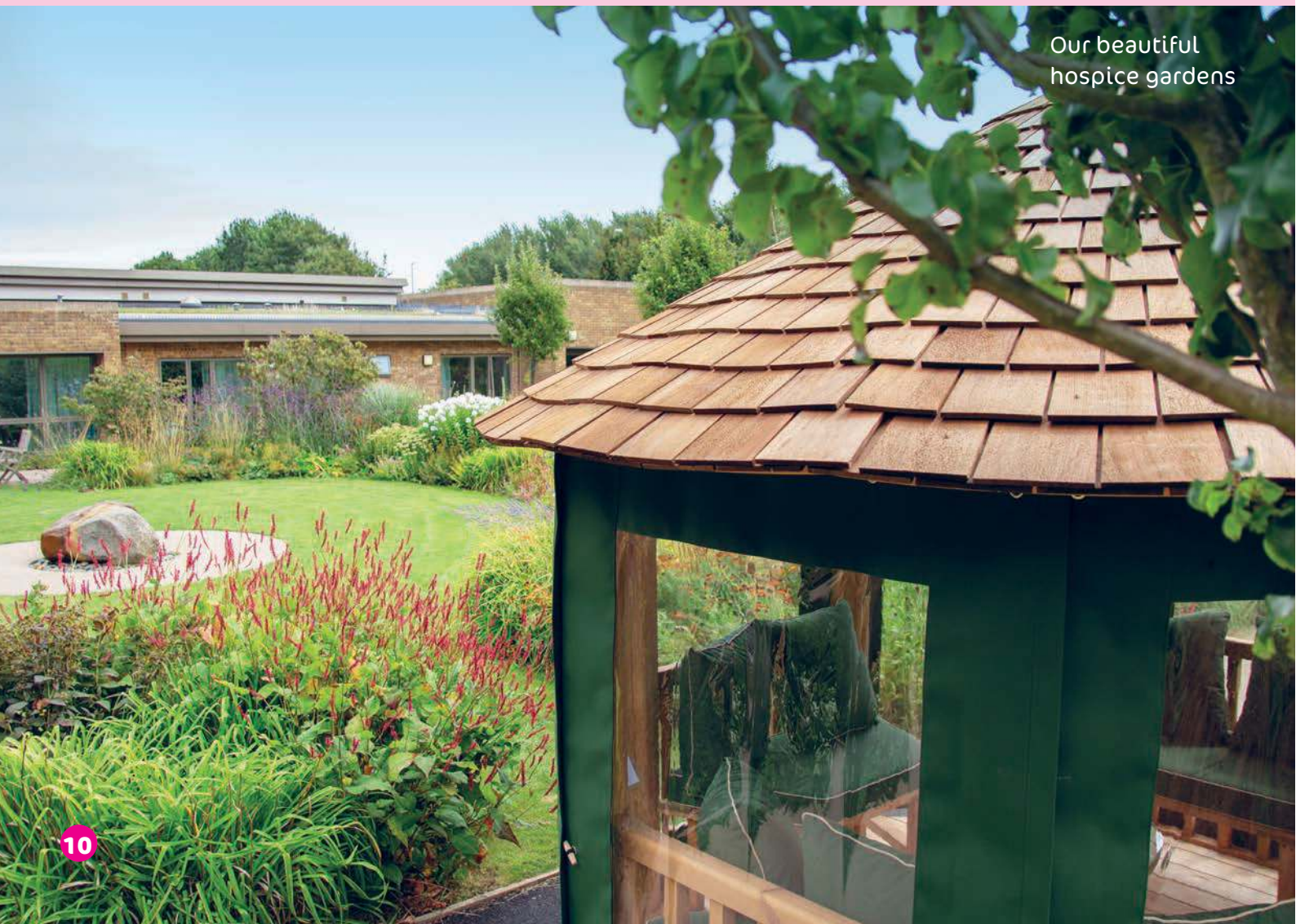
Our beautiful hospice gardens

Testator: A person who has made a will or given a legacy.